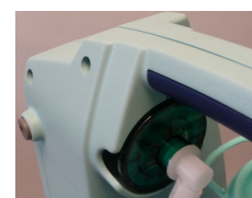
Easy release Hydrophobic filter and 'softgrip' carry handle.