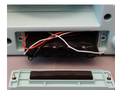
Simple battery replacement