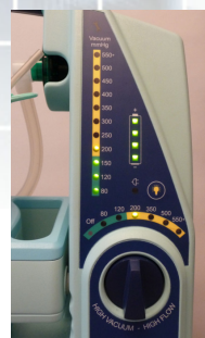
Clear digital display with single large vacuum control knob