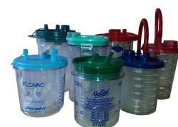
Cradle support for MGE reusable cannisters and various liner systems including Serres, Vacsax, Cardinal Health, FloVac, MTP and others.