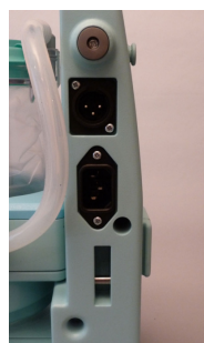
Internal onboard charger capable of running directly from AC and DC supplies.