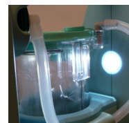
Bright on-board LED light for low light situations

It's not just in operation that the e.p.s excels. For simple cleaning, the unit has a wipe down display and a removable bottle cradle. And to aid maintenance and support, there is a service indication light, an easy access battery for fast replacement and the ability to download usage data to assess how much the unit is actually being used.