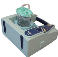
Rotating bottle for stable positioning on uneven surfaces