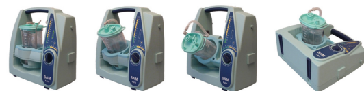
The SAM e.p.s - Revolutionary in design